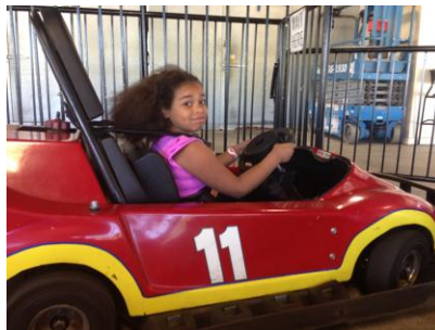
GO CARTS AND FROZEN YOGURT!